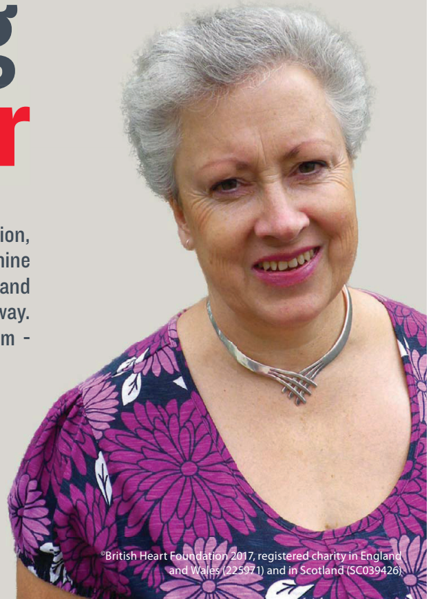
© British Heart Foundation 2017, registered charity in England and Wales (225971) and in Scotland (SC039426).